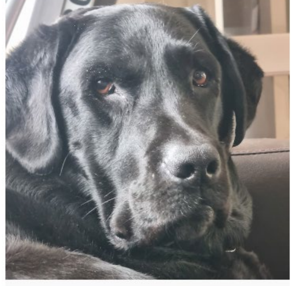
Bella from Melbourne