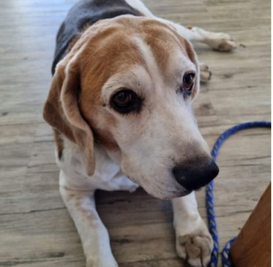
Louie from New Zealand