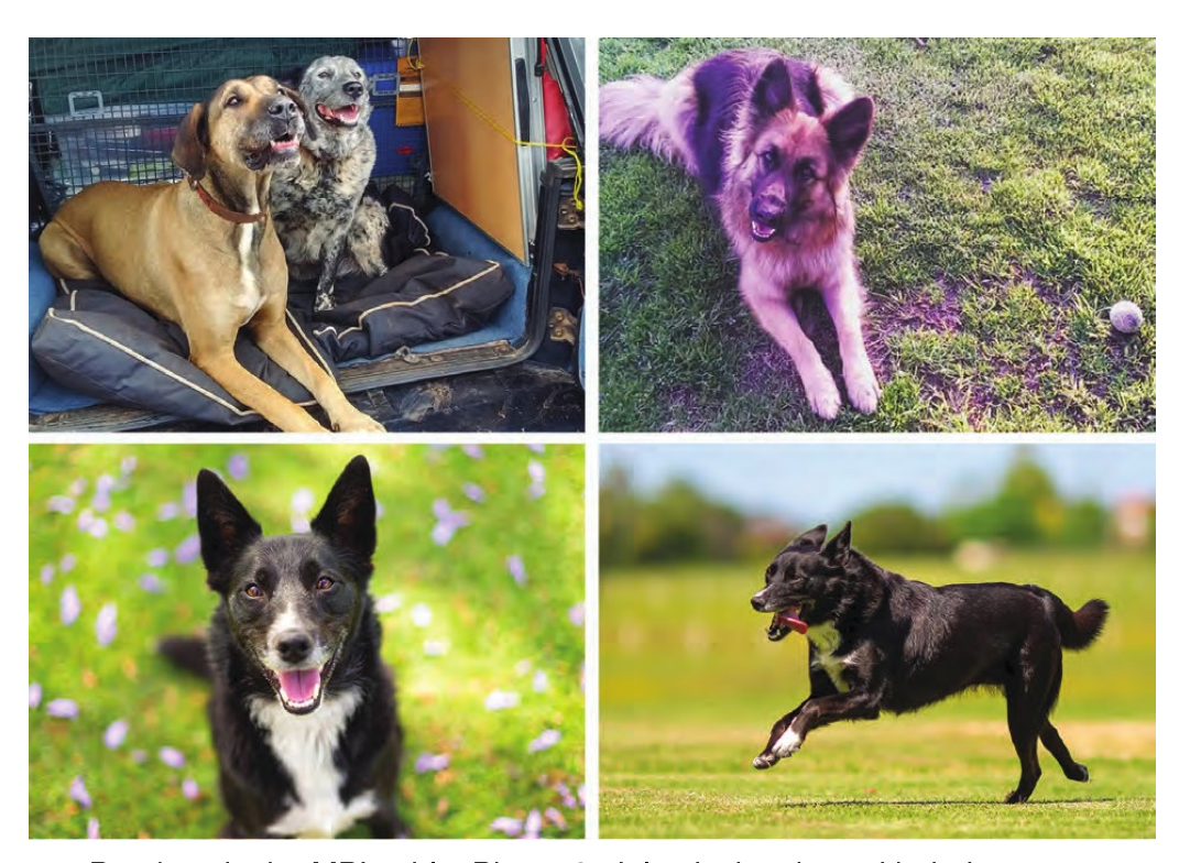
Pet dogs in the MPL tablet Phase 2 trial enjoying time with their owners

Trial recruitment continues in Australia with PharmAust successfully fulfilling interim Phase 2 trial endpoints. 27 pet dogs have now been treated using MPL monotherapy. With continued positive outcomes, PharmAust is preparing for a successful Phase 2 completion and the commencement of a subsequent registration trial.